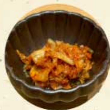
Chinese Cabbage Kimuchi

Additional a la carte menu 250yen each ※Small bowl size for lunch