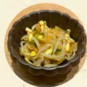
Bean Sprouts Namul