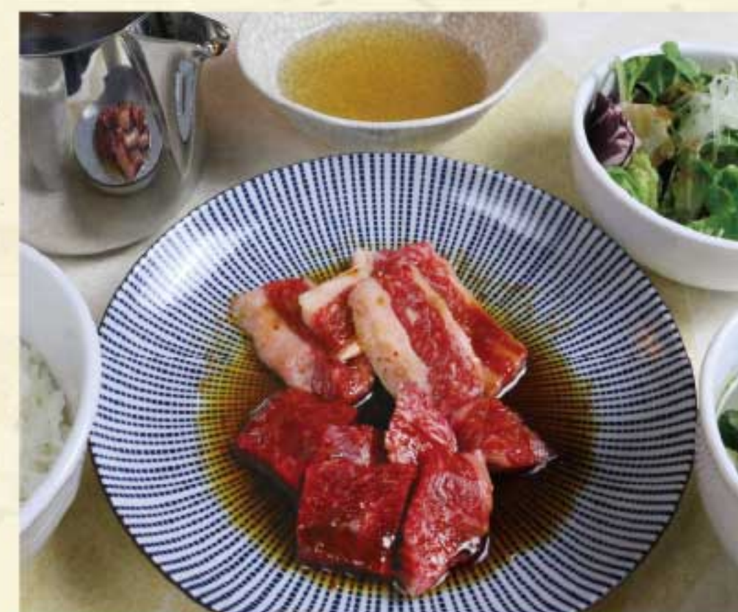
High Quality Thickly Sliced meat Lunch 2,500yen