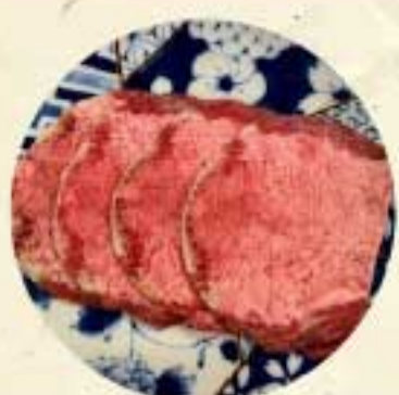
High Quality Salted Tongue 1,050yen