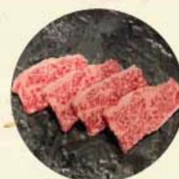
Wagyu Short Ribs 850yen