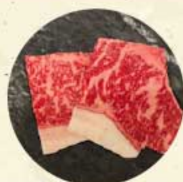
High Quality Loin 850yen