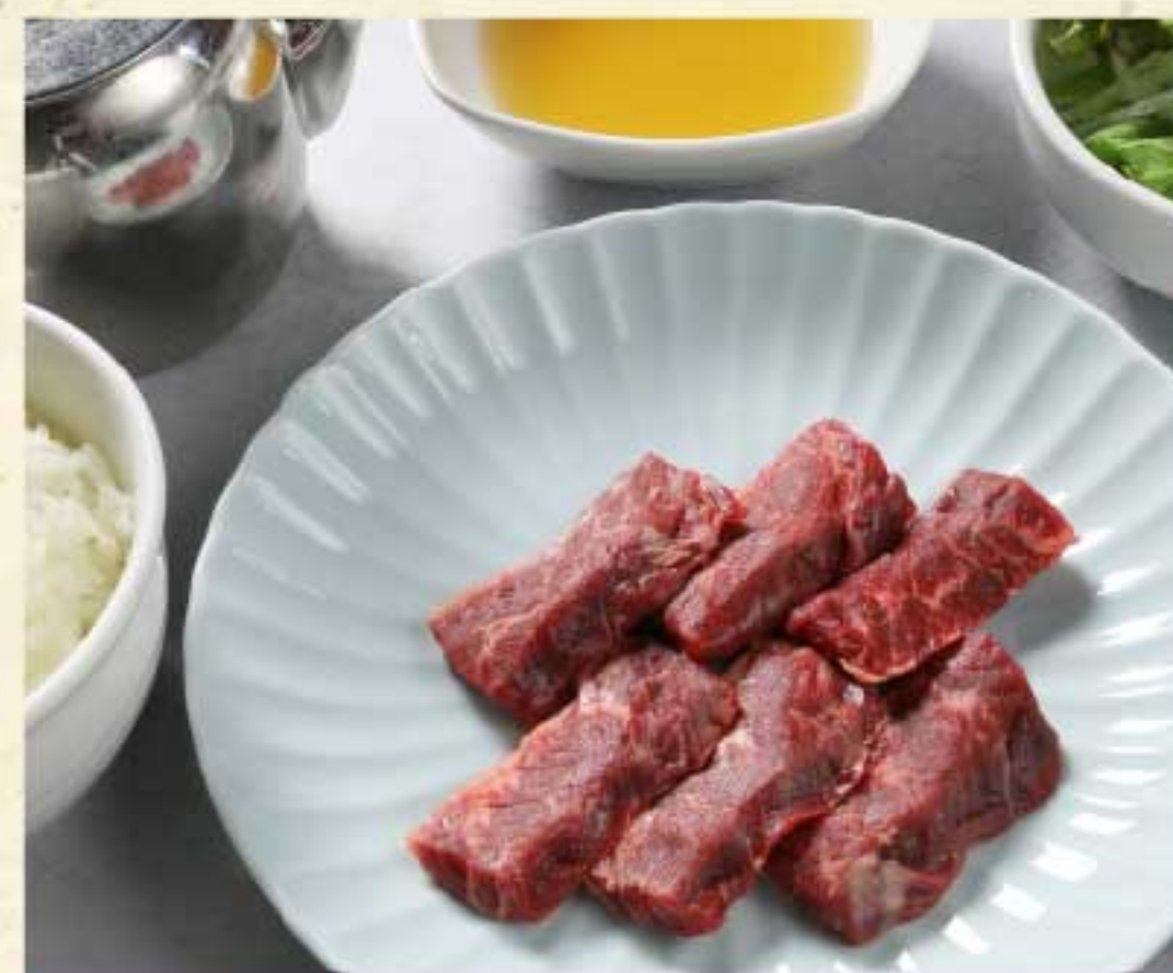
Outside Skirt Lunch 1,750yen