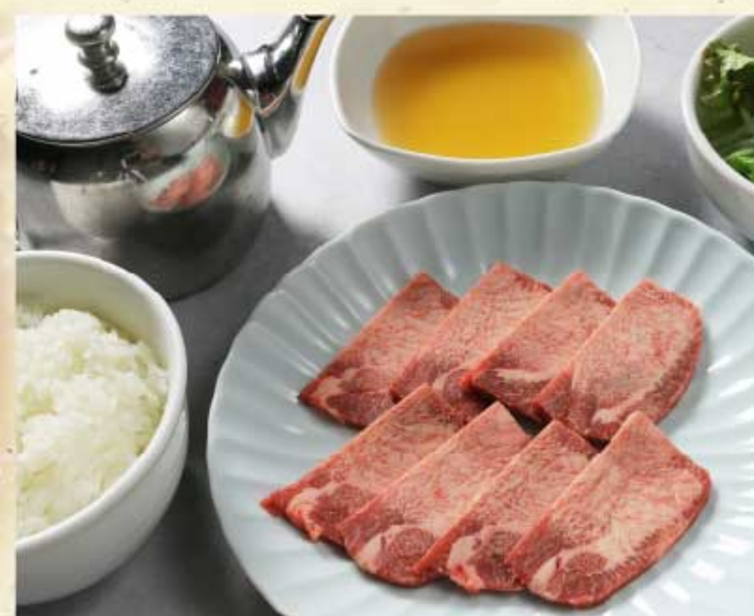
High Quality Tongue Lunch 2,150yen