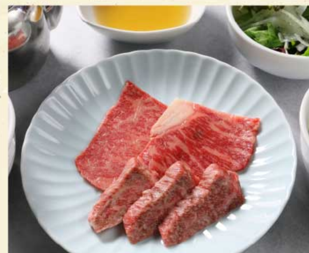
High Quality Loin Short Ribs Lunch 1,750yen

Additional a la carte menu 250yen each ※Small bowl size for lunch