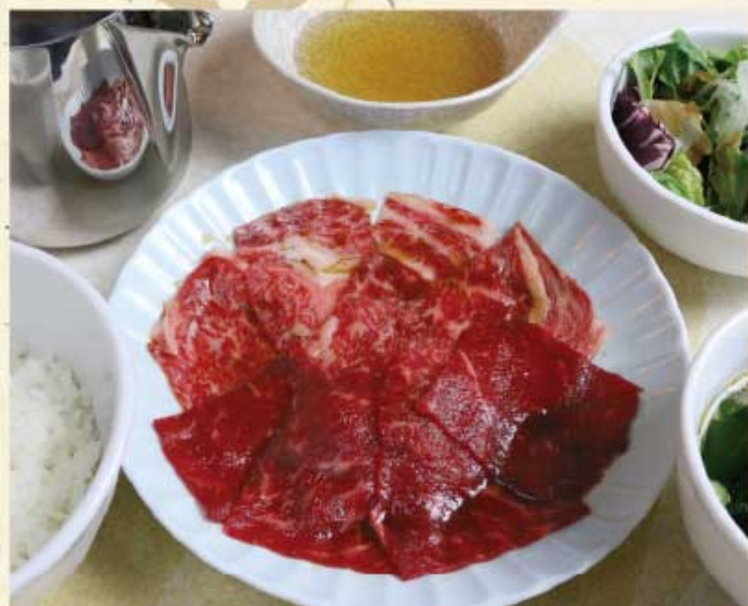
Thinly sliced meat lunch 1,600yen