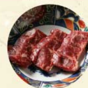
Outside Skirt 850yen