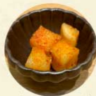
Daikon Radish Kimuchi